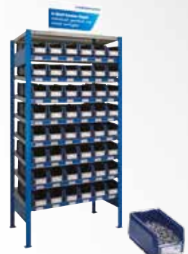
H-Shelf kanban shelf