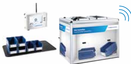
H-Box RFID ordering system