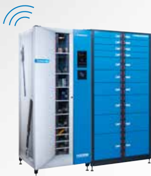
H-Rent equipment loan system