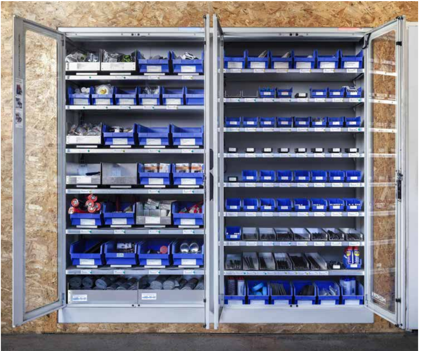
The H-Scale load cell cabinet is ideal for faster and less complex product issue. No matter whether it's large or small products – there are virtually no restrictions.