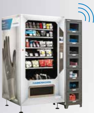
H-Save automatic dispenser with optional H-Sidebox

Using the right logistics solution reduces process complexity, ensures supply and decreases non-value-added activities. We are pleased to advise you!