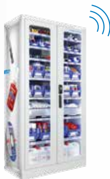
H-Scale load cell cabinet