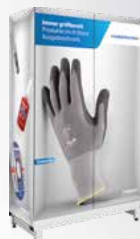
H-Store dispensing cabinet