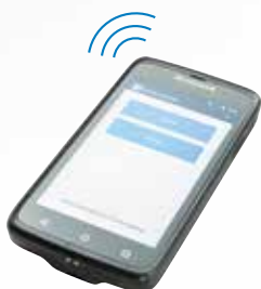
H-Scan online scanner