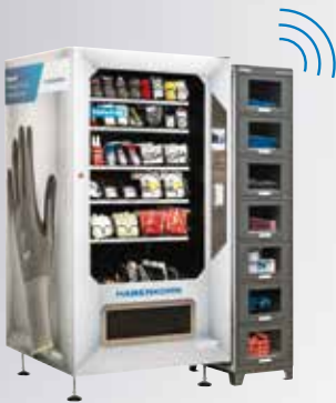
H-Save automatic dispenser with optional H-Sidebox

Using the right logistics solution reduces process complexity, ensures supply and decreases non-value-added activities. We are pleased to advise you!