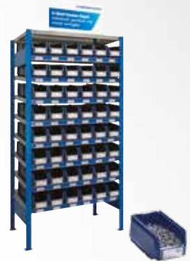
H-Shelf kanban shelf