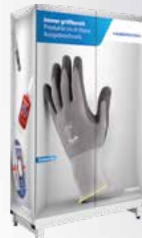
H-Store dispensing cabinet