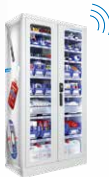
H-Scale load cell cabinet