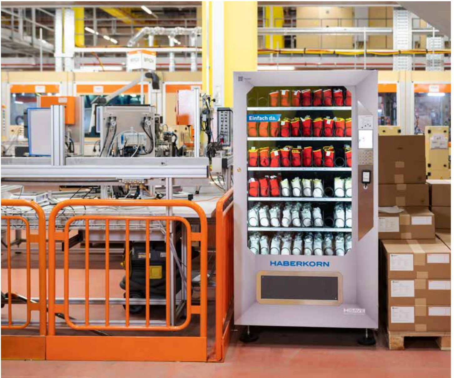
The space-saving solution for supplying PPE products: the H-Save automatic dispenser at Julius Blum GmbH has optimised employee access to supplies in every respect.